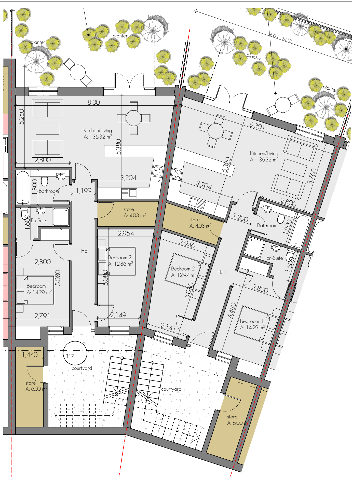
LOWER GROUND FLOOR 1:100

NOTE: PLEASE NOTE BUILDING SECTION F1/F2/F3/F4 IS THE TYPICAL BUILDING SECTION FOR HOUSE TYPES F1, F2, F3 & F4. PLEASE REFER DWG NO 18205-PLA-077 FOR BUILDING SECTION